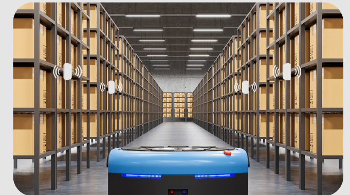
Warehouse Asset Tracking

MRepeater integration, MWC01 Badge Bluetooth Repeater and MBT02 Asset Bluetooth Repeater. MWC01 performs accurate personnel management, with high accuracy and emergency response abilities. Besides, MBT02 performs asset tracking with efficiency. Improve workplace efficiency and security with these 2 smart gadgets, which provide precise people management, and efficient asset monitoring, and both of them are cutting-edge hardware solutions in IoT industry.